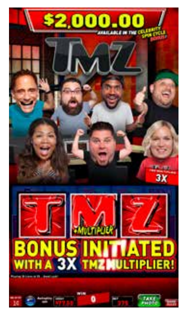
Eligible players can boost bonus winnings with random multiplier awards.

In this comical bonus round, players must pick excuses to spin their way out of sticky situations, aiming to find celebrities that will award extra spins and credit values.